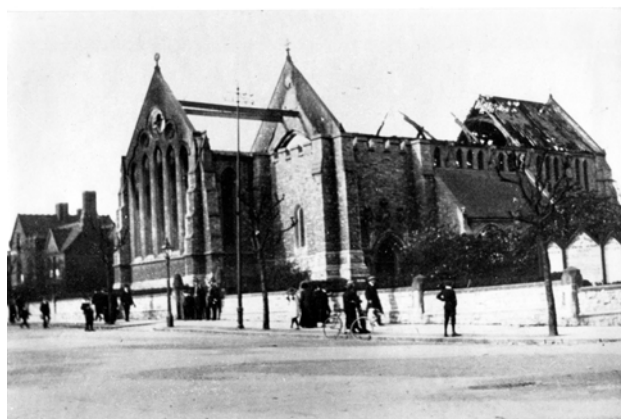
The church roof was replaced after the fires in 1913 (above) and 1945. Without help, it could look like this again ...

This is not a religious plea — it will affect Hill dwellers regardless of any faith they may hold. So if you can contribute in any way — please get in touch. The Church and Community Centre are not necessarily looking to you for financial support but they need ideas, contacts, helpers, supporters and advocates. Anybody who can help in any way should call 020 7639 1050 or go to www.thehill.org.uk/church .